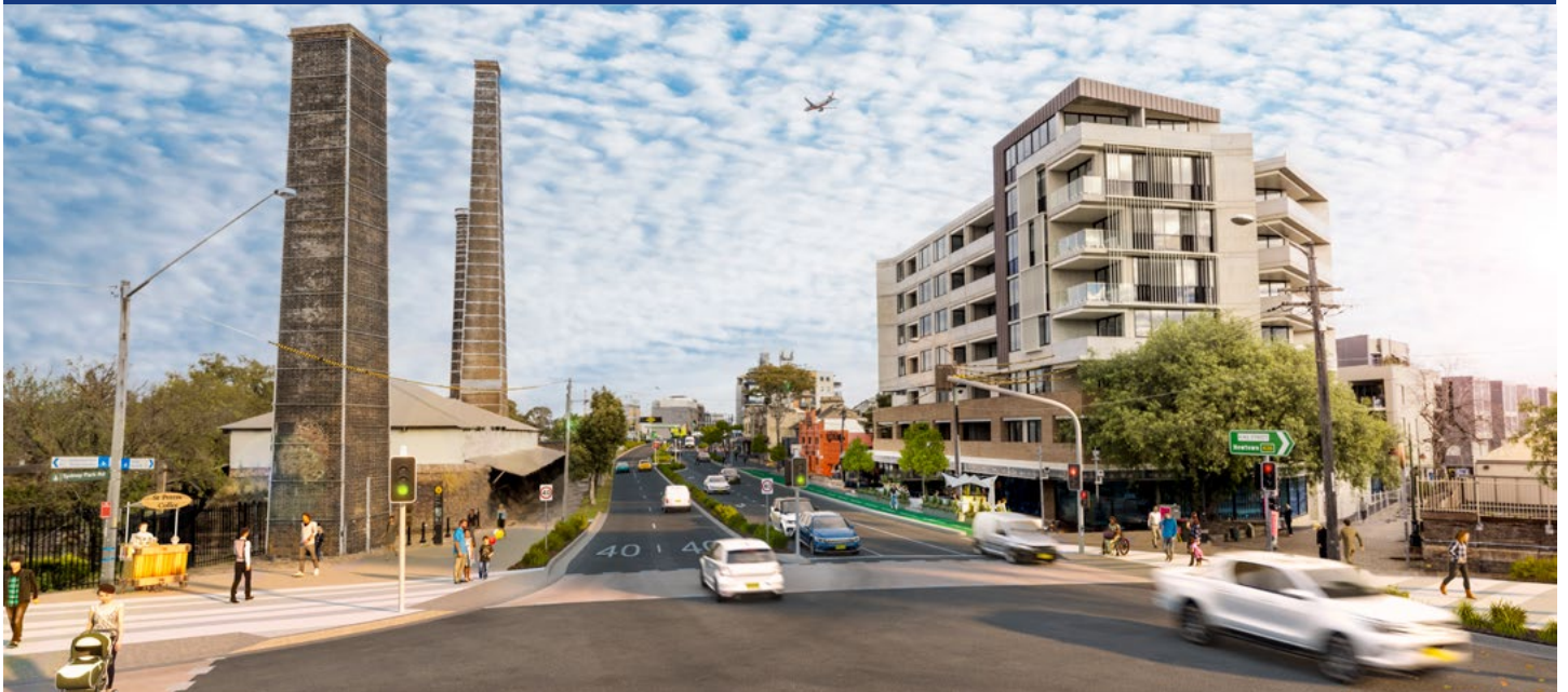
St Peters Square looking south - with new separated cycleways, widened footpaths, dynamic community spaces and landscaping