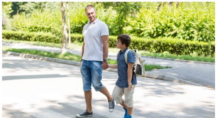
Prioritised walking links

Transport for NSW plans to return space on local streets for the community to enjoy. We're improving connectivity around St Peters, Sydney Park Road and King Street with new walking and cycling links. We'll also create a people-friendly multimodal St Peters square with dynamic community spaces for al fresco dining, recreation and entertainment.