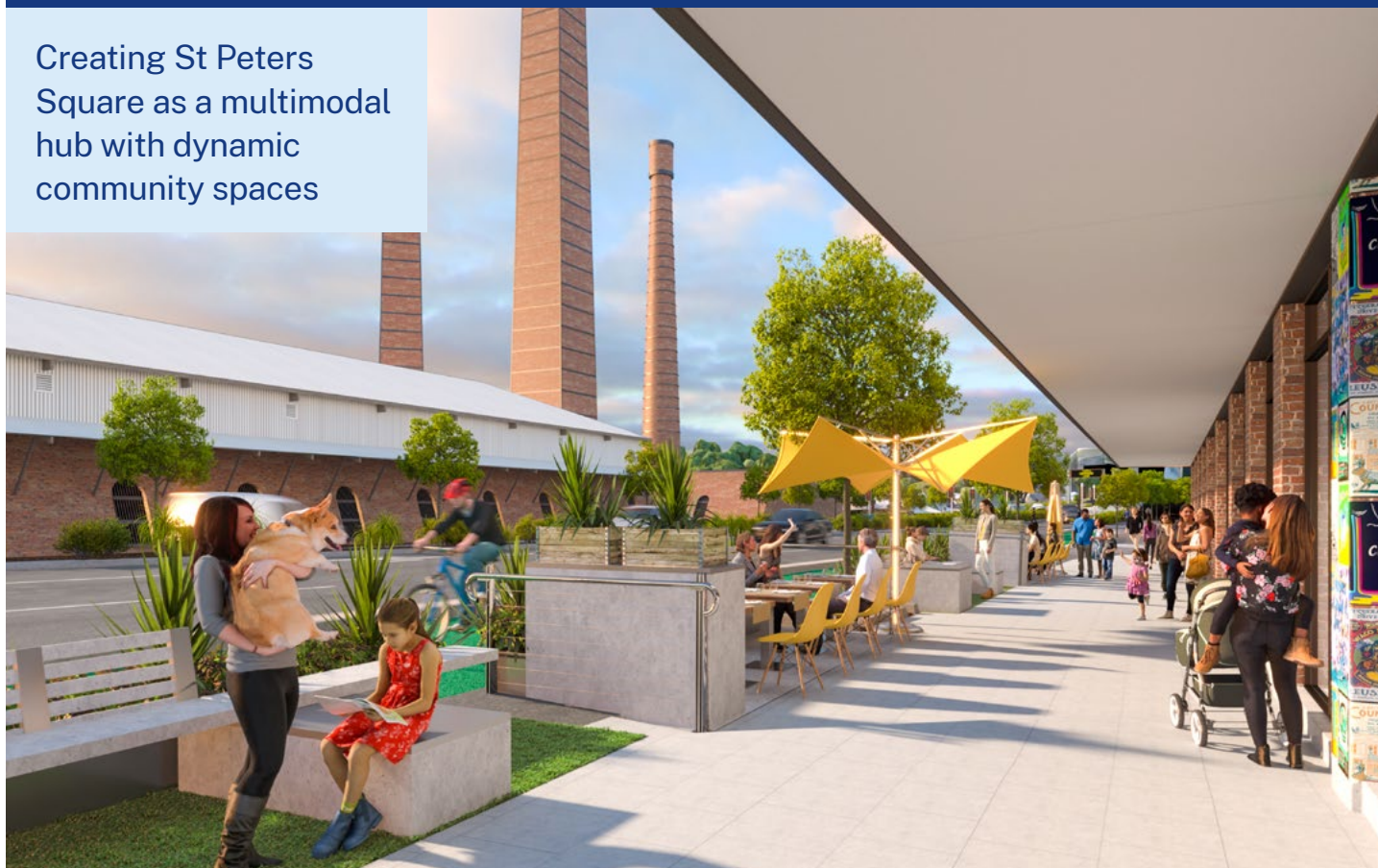
Widened footpath and dynamic community space at St Peters Square looking south-east on King Street.

Creating St Peters Square as a multimodal hub with dynamic community spaces