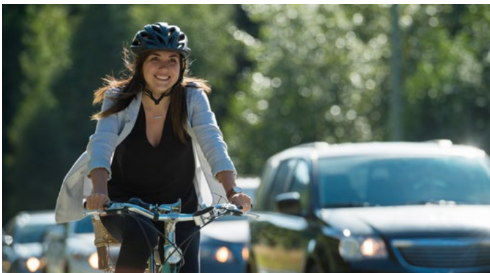
We're creating permanent separated two-way cycleways