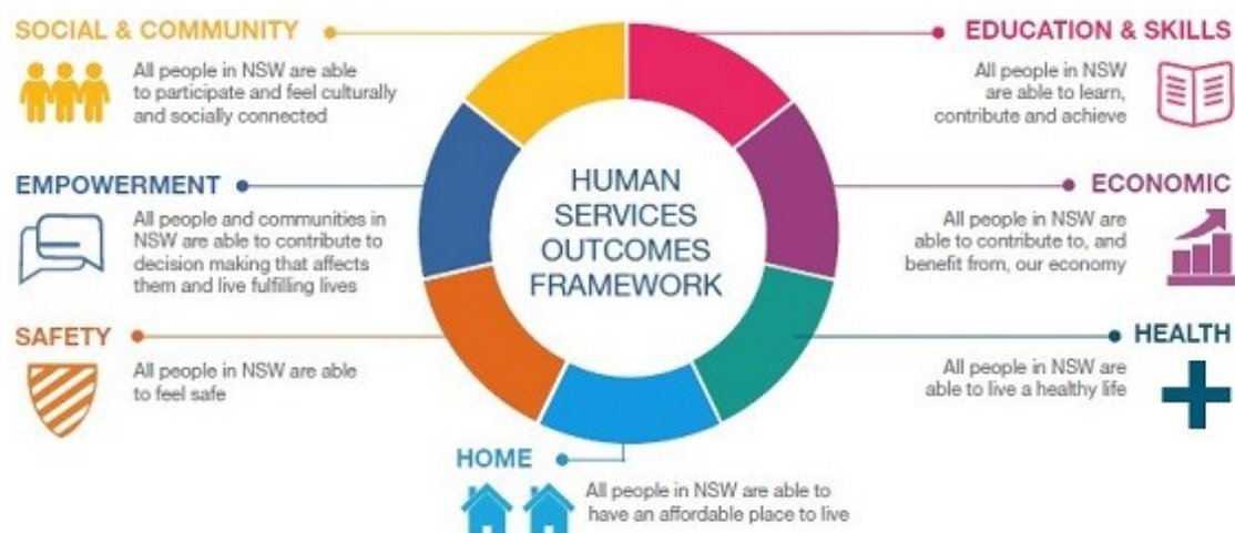
Exhibit 1: Outcome domains within the Human Services Outcomes Framework

Source: Department of Finance, Services and Innovation (accessed 28 February 2019) https://www.finance.nsw.gov.au/human_services .