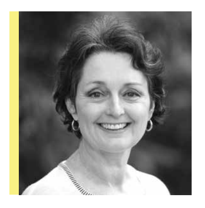
Pru Goward MP Minister for Mental Health