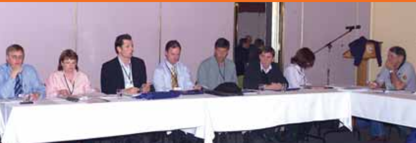
Construction Working Party