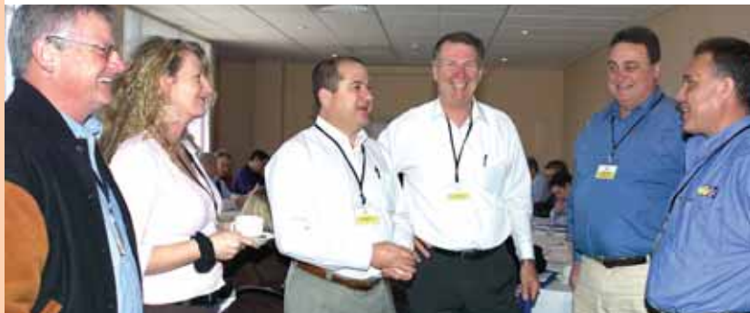
Mining and Utilities Working Party