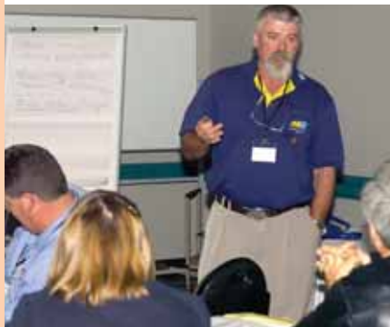
Rural Working Party