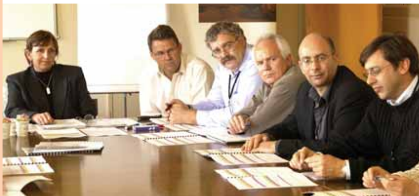
Public Sector Working Party