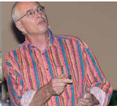
Dr Karl Kruszelnicki