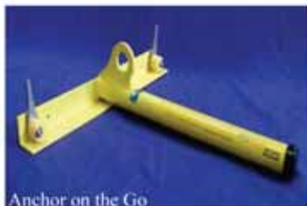
Anchor on the Go