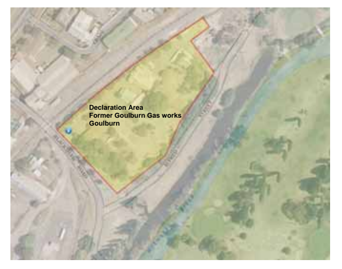
Figure 1. Land to which this declaration applies, 1 Blackshaw Road, Goulburn NSW

This declaration does not affect the provisions of any relevant environmental planning instruments which apply to the land or provisions of any other environmental protection legislation administered by the EPA.