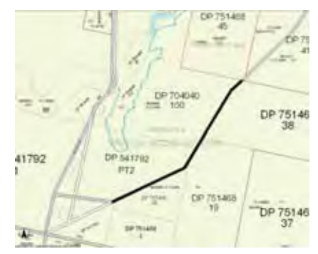
SCHEDULE 2 Roads Authority: Guyra Shire Council. File No.: AE03 H 215. W.503258. Council's Reference: D Counsell.

Crown road 20.115m wide known as Naylors Road at Aberfoyle, as shown by solid black shading on the diagram hereunder.